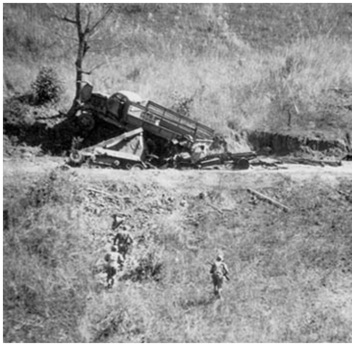
Japanese truck and tankette trapped by crater blown in the Burma Road by MARS demolition men.

Accompanied by press and public relations personnel, engineers, and military police, the first convoy pushed off for China from Ledo on 12 January 1945. After being delayed by fighting en route, the vehicles rolled triumphantly into Kunming on 4 February. The opening of the Ledo-Burma Road, soon to be redesignated the "Stilwell Road" by Chiang Kai-shek, forged the last link in the chain of land communications between Calcutta and Kunming, a distance of more than 2,000 miles. By July, gasoline also would be pumped through a pipeline constructed from Ledo to Kunming, 928 miles away, paralleling the Stilwell Road.