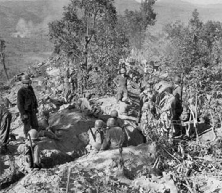
Marsmen on Loi-kang Ridge.

After a twenty minute artillery and mortar preparation, the 2d Squadron of the 124th Cavalry moved out at 0620 toward Hpa-pen