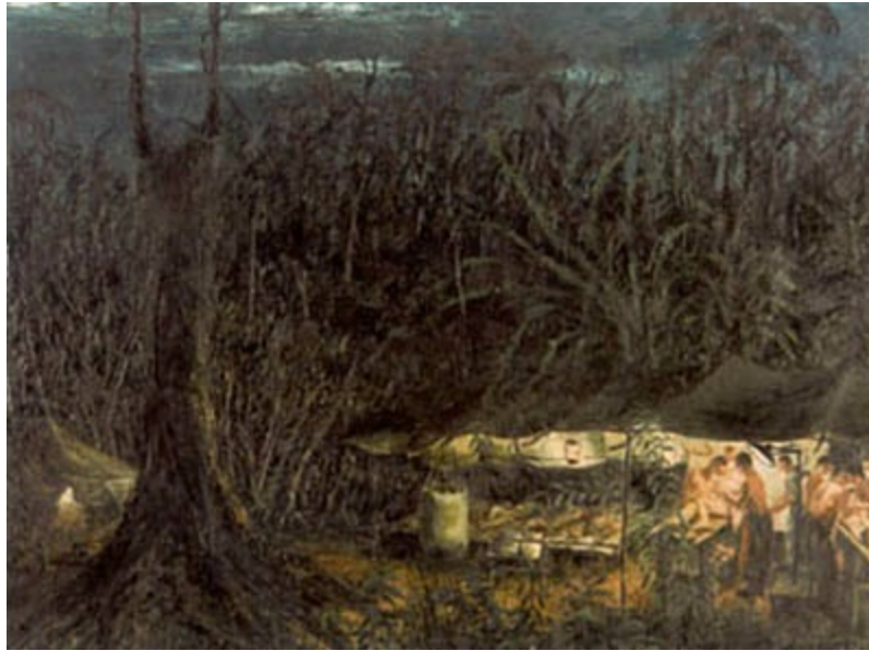
"Moon Over Burma," by Howard Baer. (Army Art Collection)

transportation. For example, during the Japanese three-month siege of Imphal in early 1944, British troops and about 40,000 noncombatants had been supplied entirely by air. Planes had brought in 61,000 reinforcements and 28,000 tons of supplies. This history-making airlift operation, much larger than any undertaken before, provided the formula for future success in Burma. Other major aviation accomplishments included delivering over 30,000 troops and 5,000 animals to Stilwell's forces in central Burma, far behind enemy lines, and maintaining them for several months; and transporting over 75,000 Allied troops, including two fresh Chinese divisions from the Y Force in China, and almost 100,000 tons of supplies, into the Allied-held airfield near Myitkyina over a five month period. Finally in the spring of 1945, aerial resupply played a decisive role in General Slim's British Fourteenth Army attack on Meikila and its follow-on advance toward Rangoon.