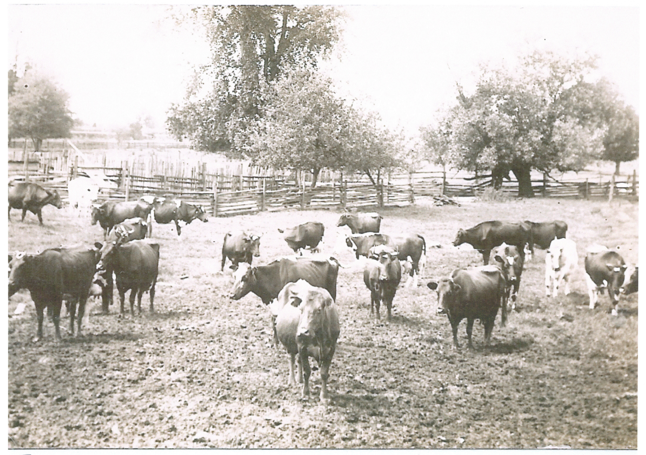
JEROM GENERIC PHOTO]