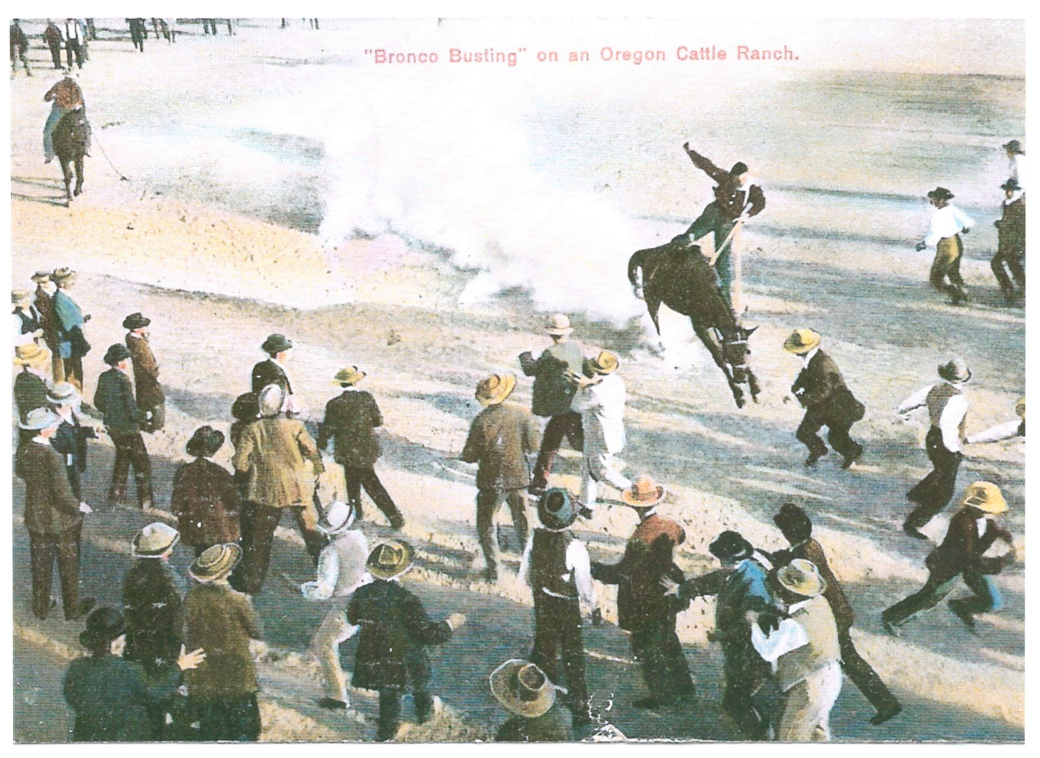
[FROM POST CARD]