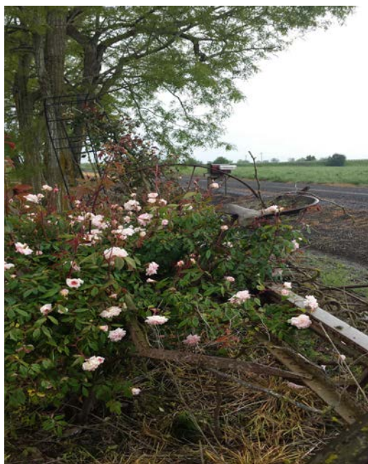
Hay rake used by the Falk Family for farming, currently used in the yard landscape.