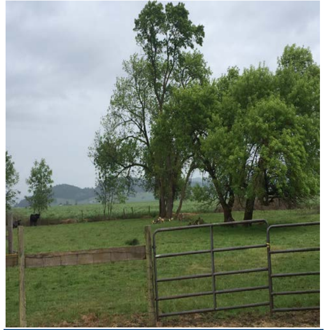
Looking East towards Brownsville foothills.