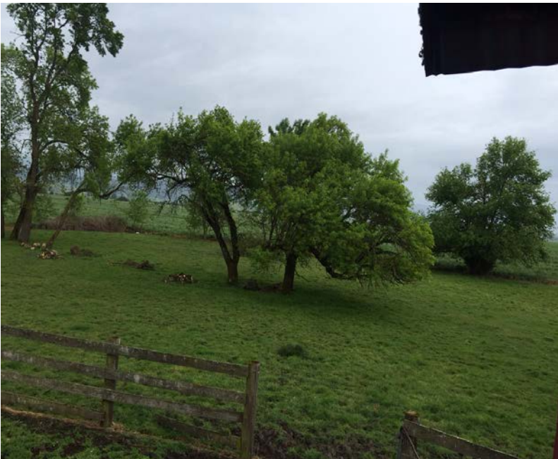
Current cattle pasture.