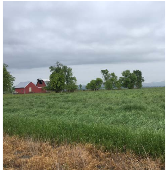
The 2015 Ryegrass crop is growing on the 160 acres that the family has farmed since 1907.