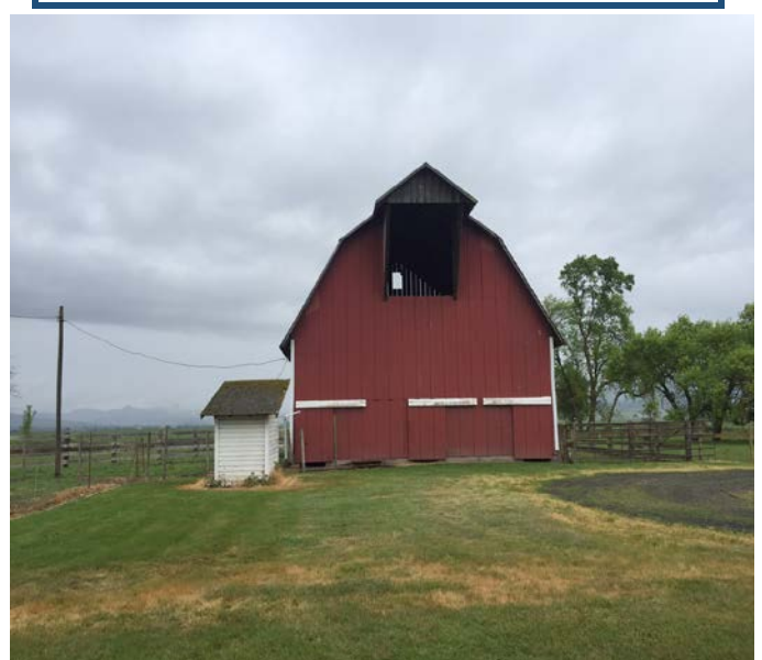
Falk Barn front view. Not sure of building date.