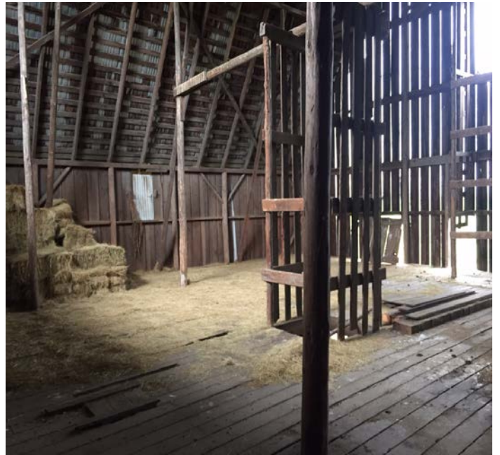
Loft of Barn.