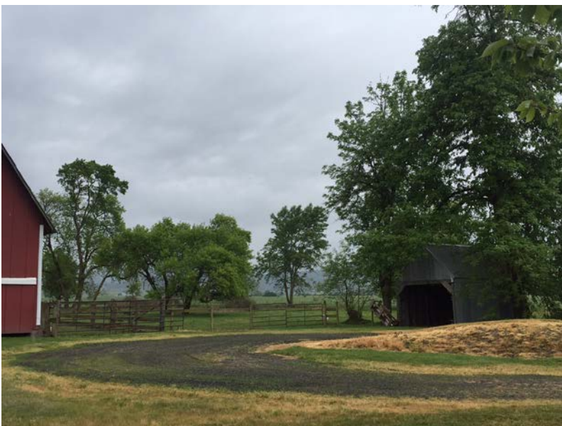
The little building to the right was built from recycled wood from the Kirk School and several other old buildings in the Halsey area.