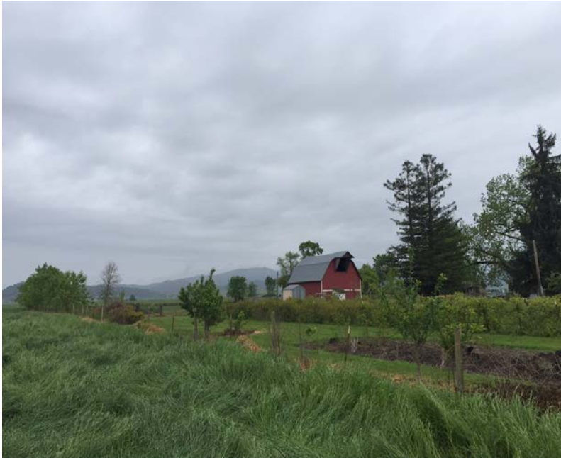
Looking East from I-5 you can see the Falk Barn and surrounding landscape. Grapes are shown growing in the foreground.