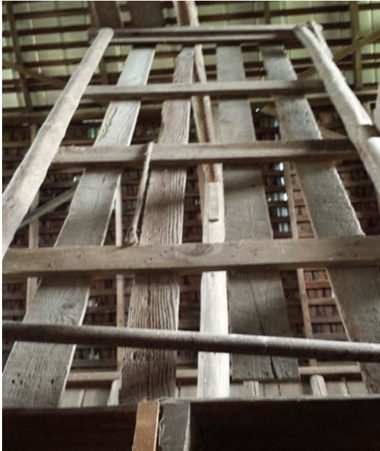
Falk Barn hay slide.