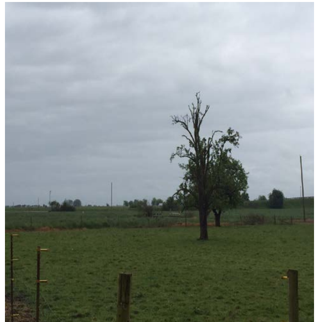
Fruit trees that have been enjoyed by several generations.