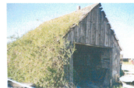
Original home in 1911