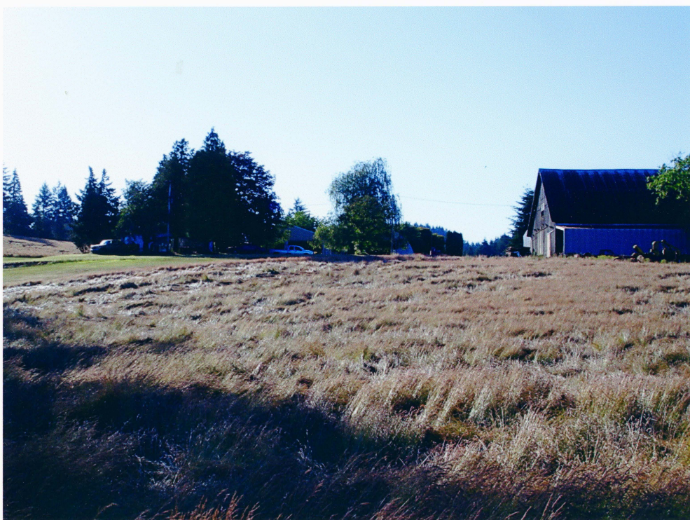
the farm 2009