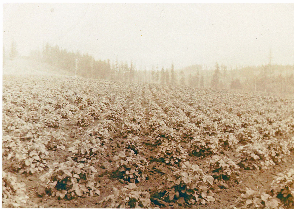
strawberry fields 1930's