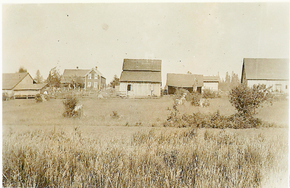
the farm about 1928