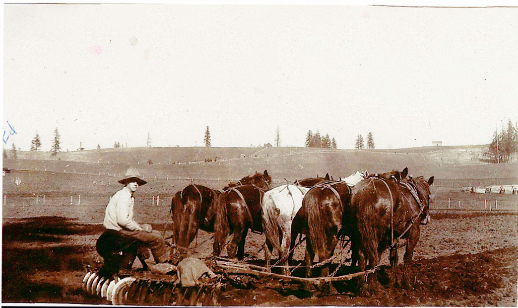
Edwin disking, abt 1928