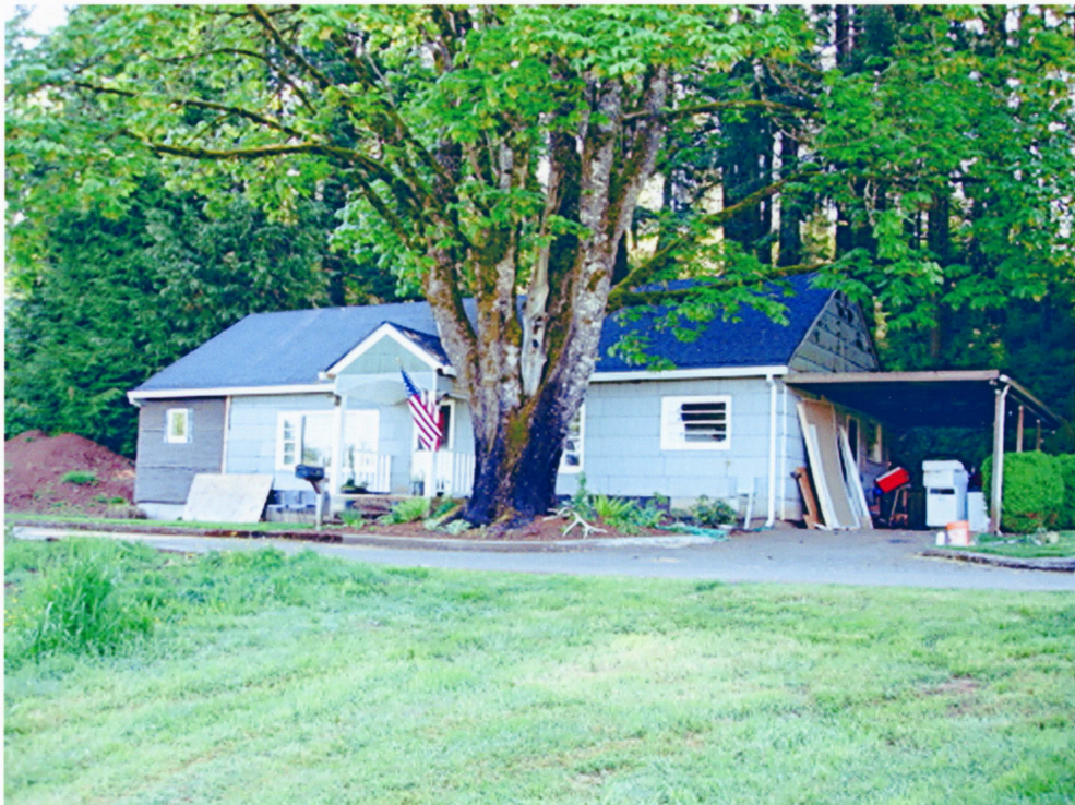
the house being remodeled again 2009