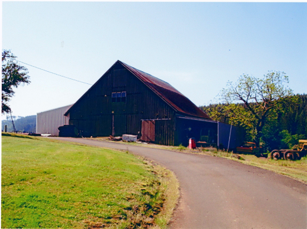
the barn 2009