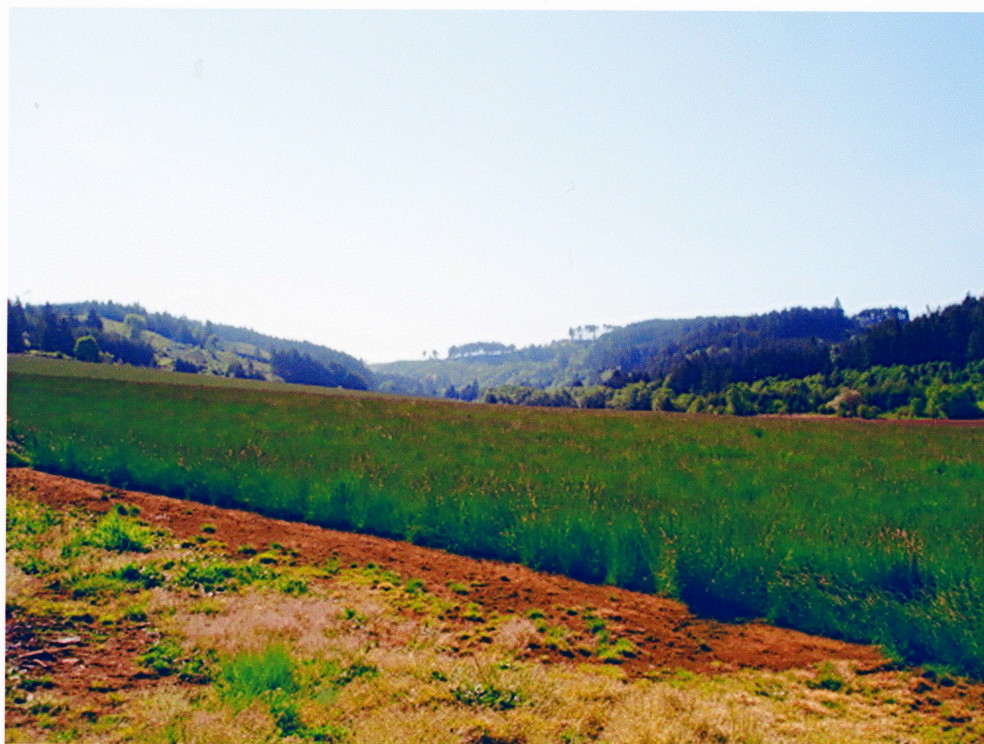
grass seed fields 2009