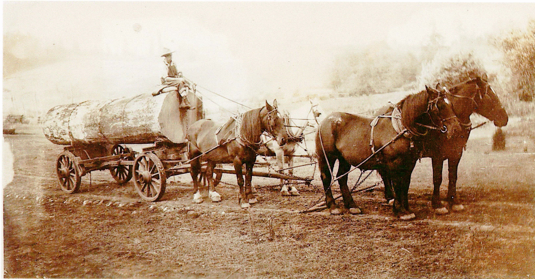
Edwin hauling logs, abt 1928