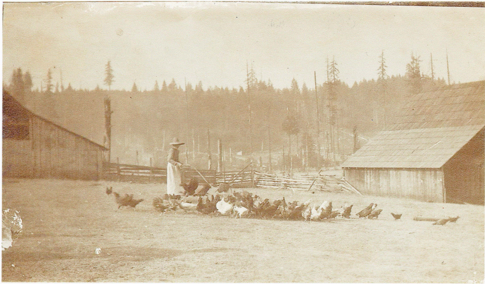
Amelia Peters in front of the barn, abt 1928