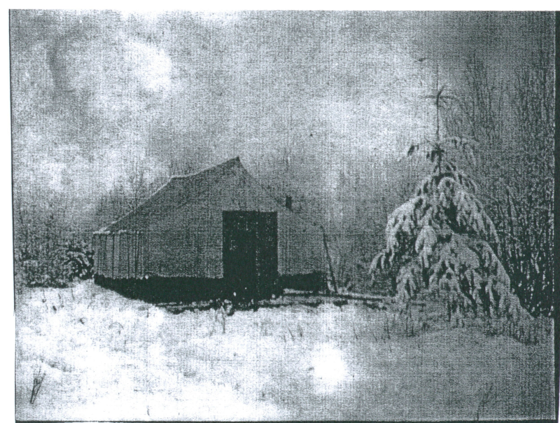
first winter in tent 1908