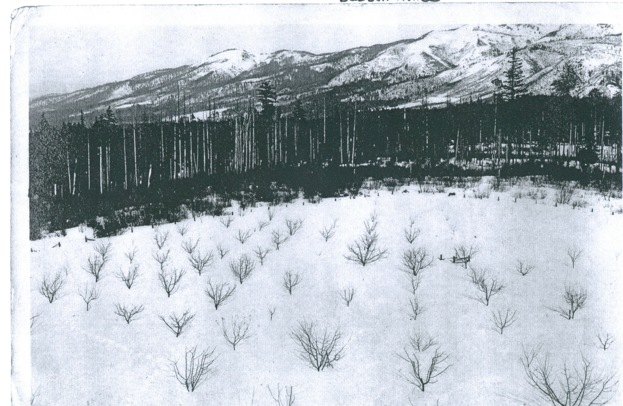
East Hills to East apple Planting