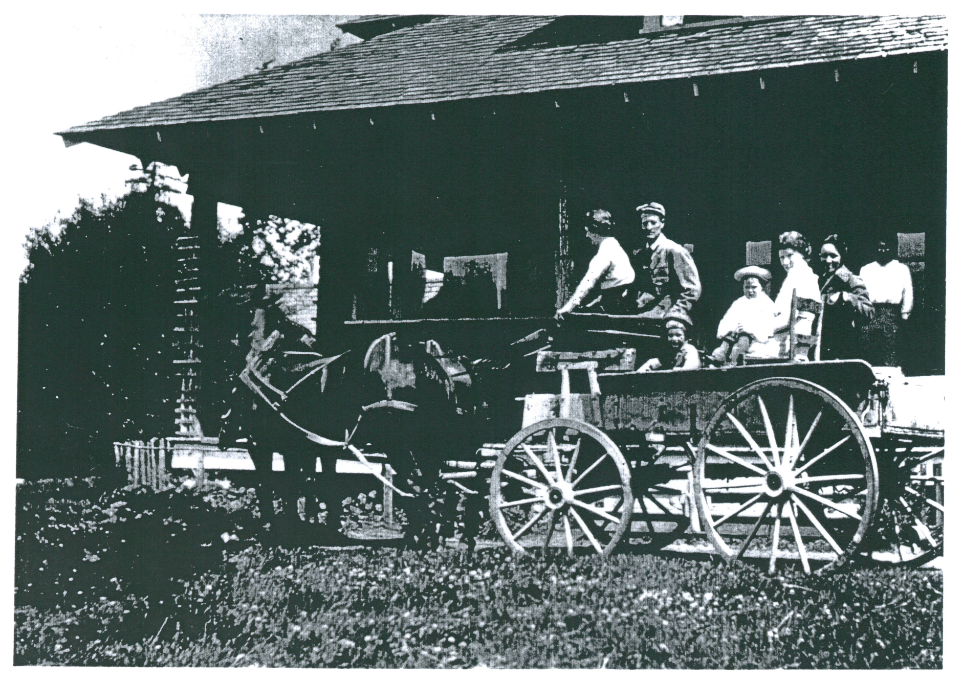
Babson family 1913 Parkdale, OR