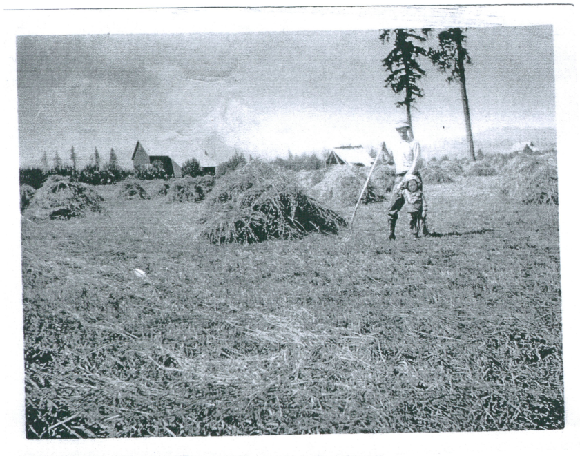
Putting up hay about 1912