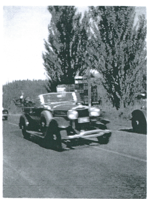
Sept 27, 1937

Franklin Rousevell driving by awalon Orchado