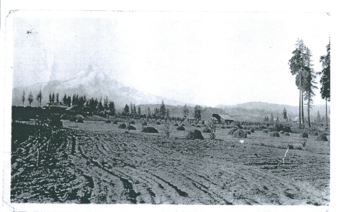
Avalor Barn young Planking