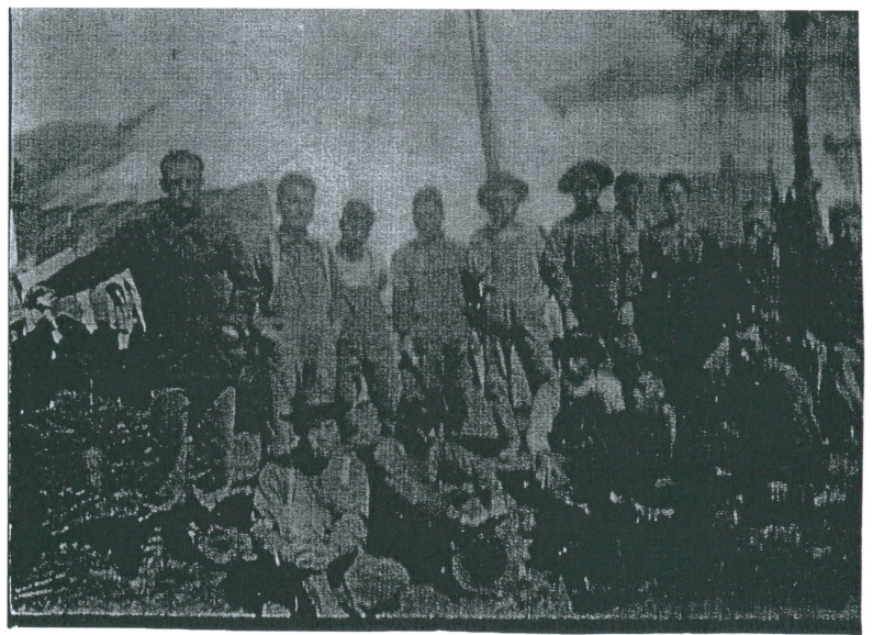
Japanese workers 1908