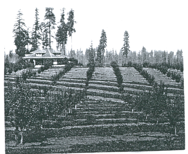
Babson Brothers orchard in 1913. Apple trees have yet to bear fruit. Uncleared forest borders the north side.