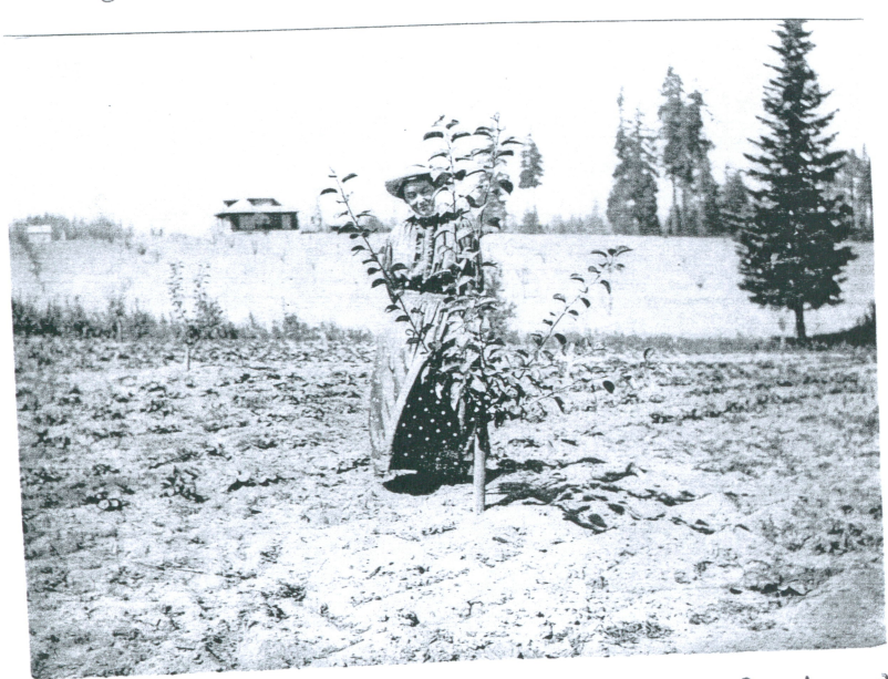
grace in newly planted Orchard served Surrounded by Forest