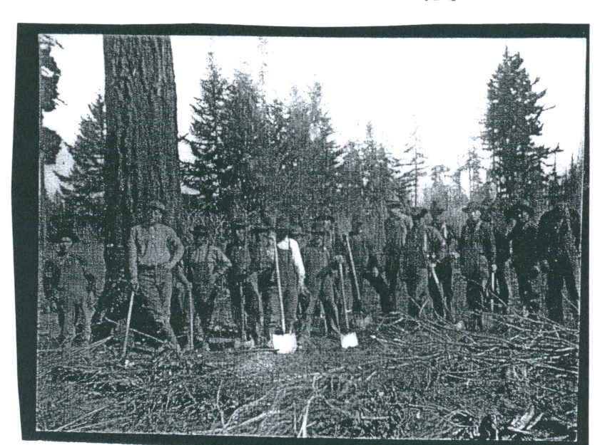
Japanese workers) 1908