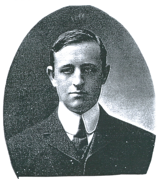
Dad 19 years old. Class of 1902 Graduated Cum Laude, Princeton

The following is the Official Report of the standing of