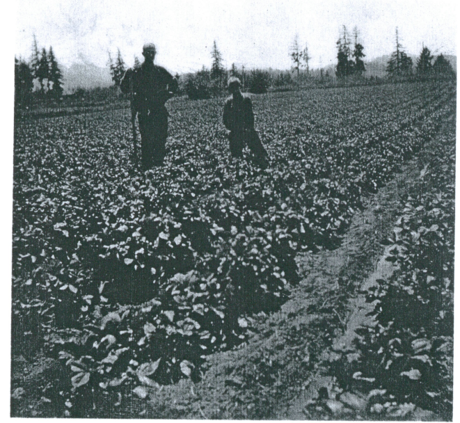
Straw be mes