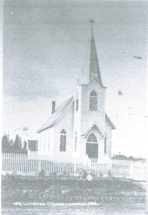
BETHANY LUTHERAN CHURCH, WARREN, ORE.