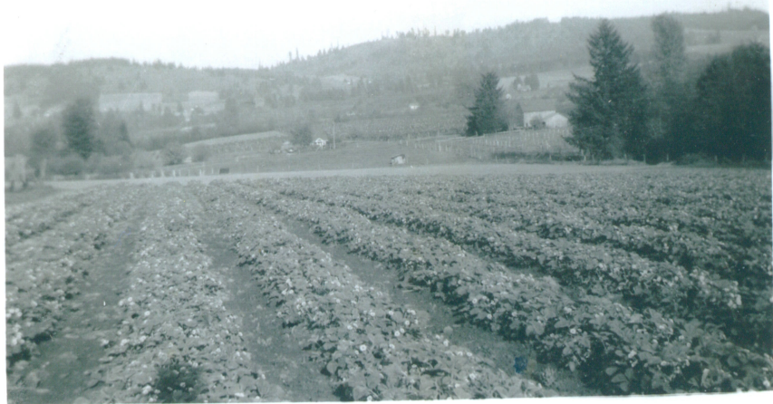
May 49 - Strawberries in bloom