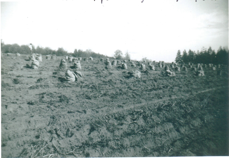
sacks of potatoes just dug in field