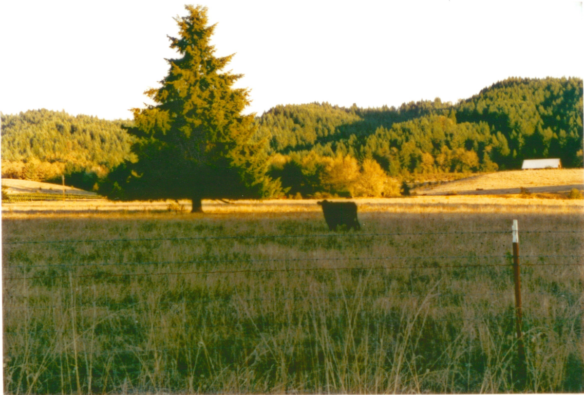
View from Driver Valley Road (County) which bisects the ranch. One of the haybarns in right of photo.