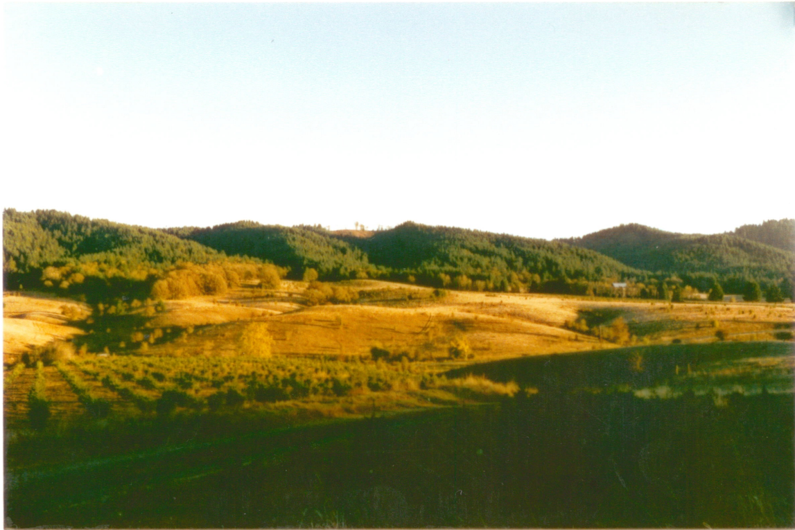
View from family ranch house looking south. Fields and timbered hills in background are ranch property.