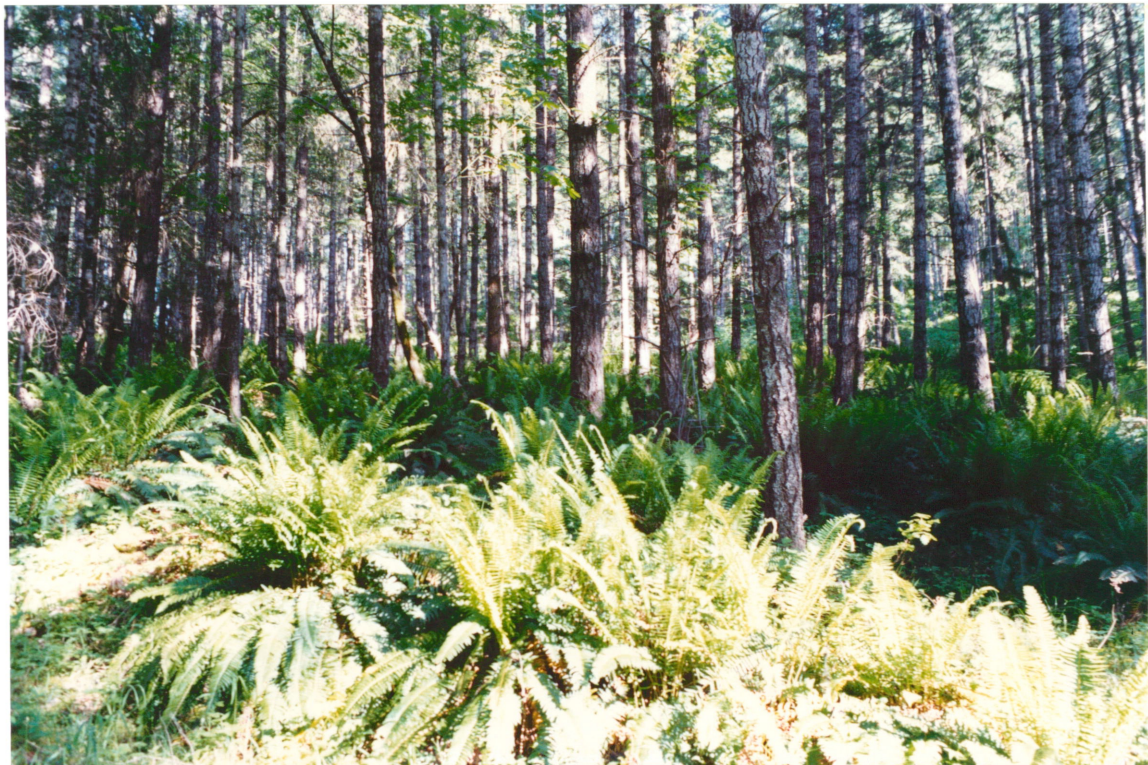
New timber coming.