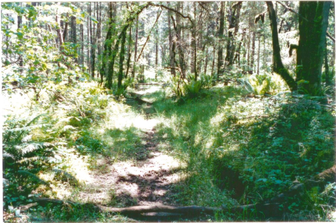
Logging road overgrown in ten years.