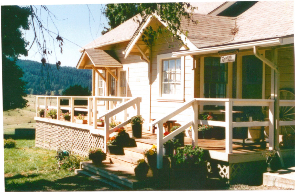
Ranch manager's house built in 1920's and remodeled in 1987.