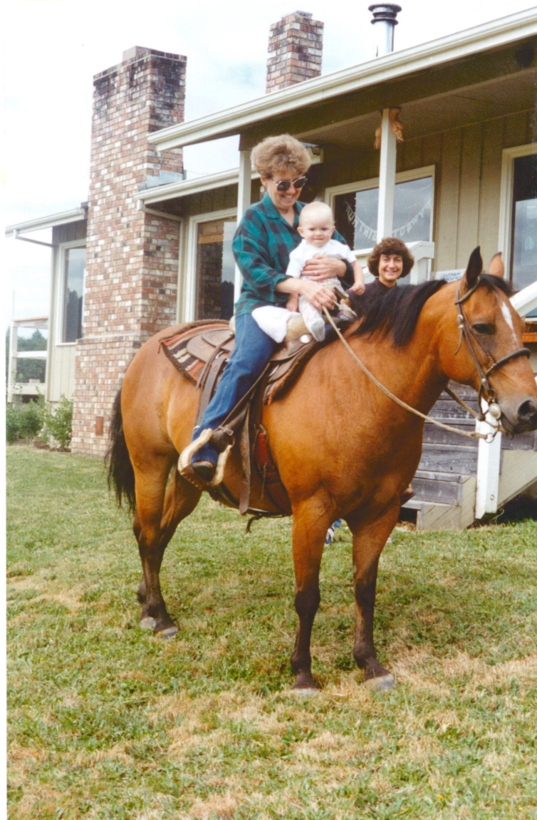
Ranch manager's wife in front of the family house with my daughter and granddaughter.