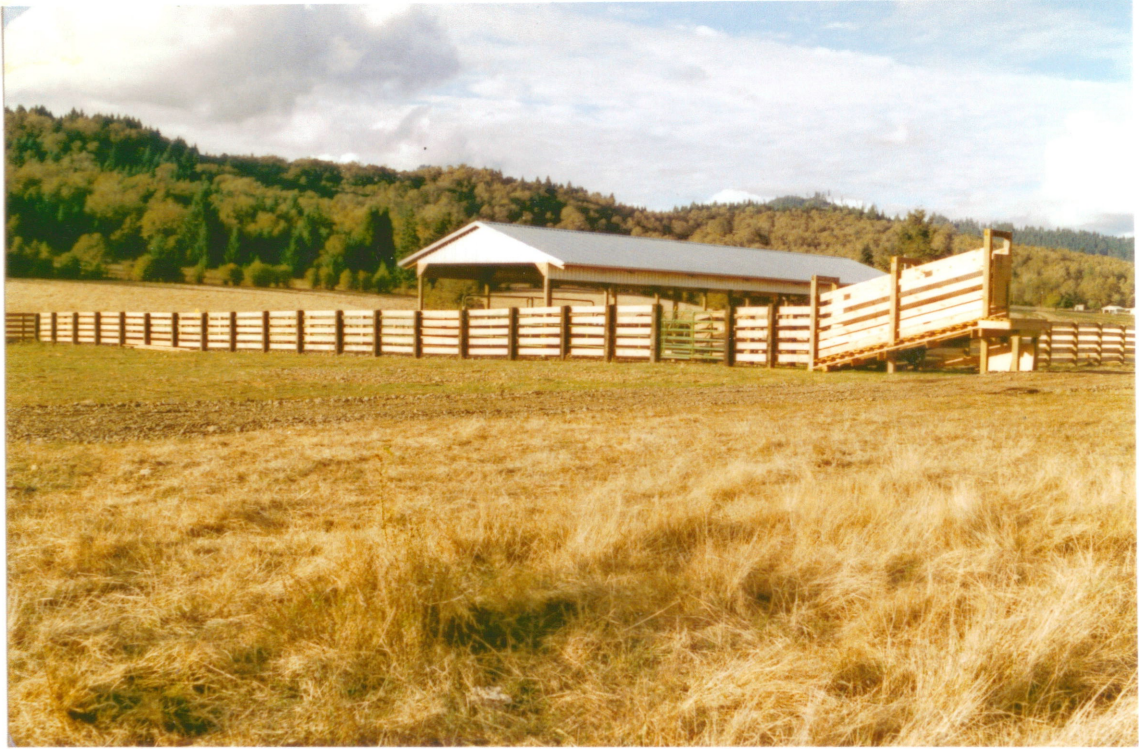
New corral. Ranch houses and horse barn on far right of photo in the distance.