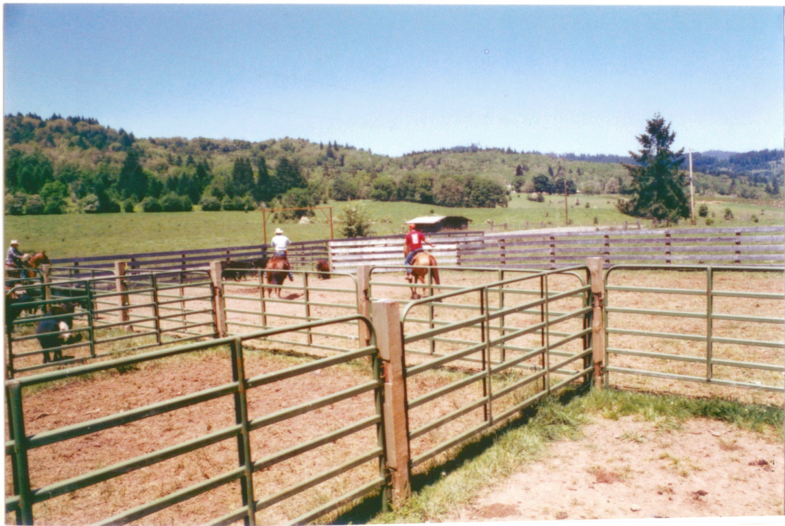
Stock pens at the corral as men get ready for branding.