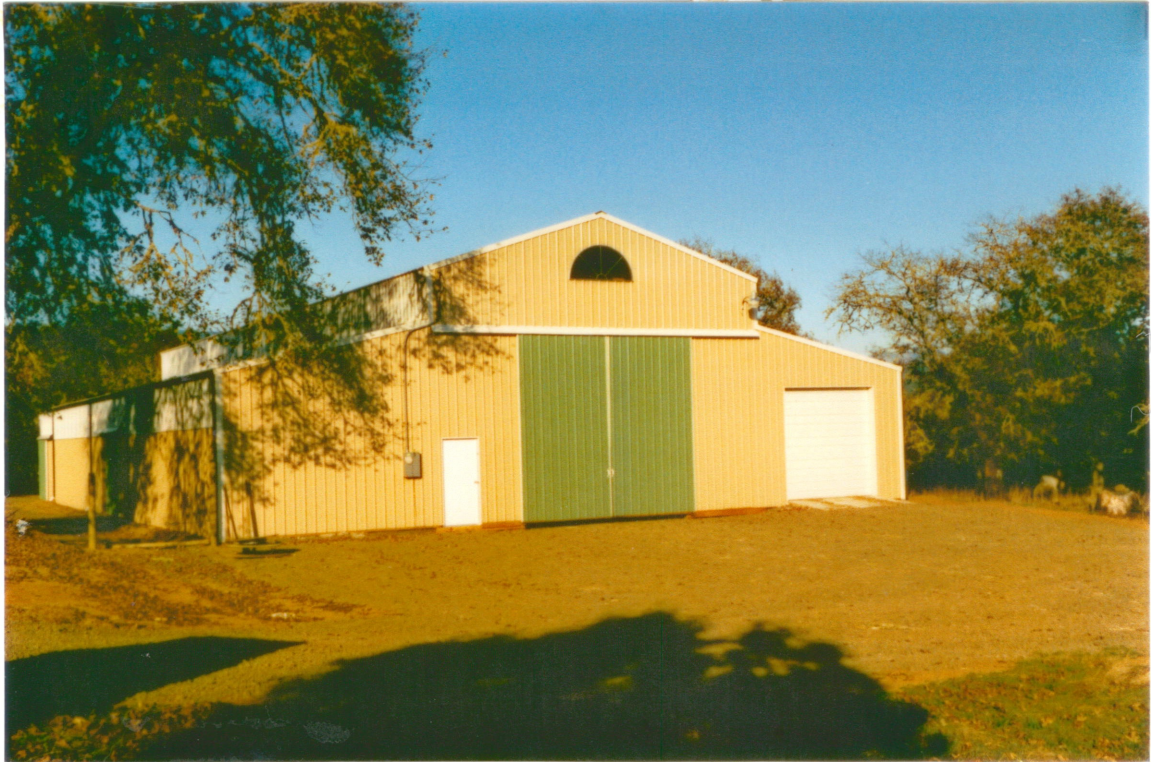
Horse barn built in 1988