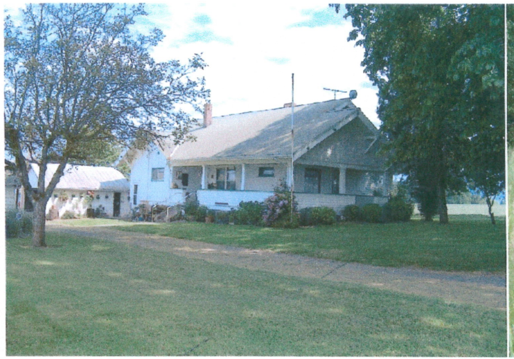
House built in 1921 by Edwin Hobart