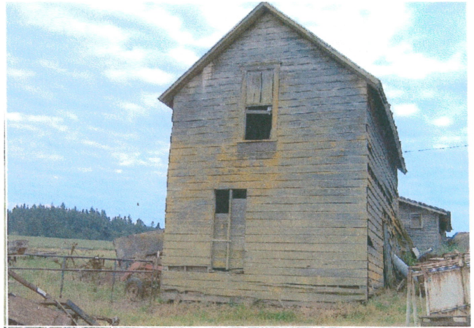
House built about 1906 by Edwin Hobart