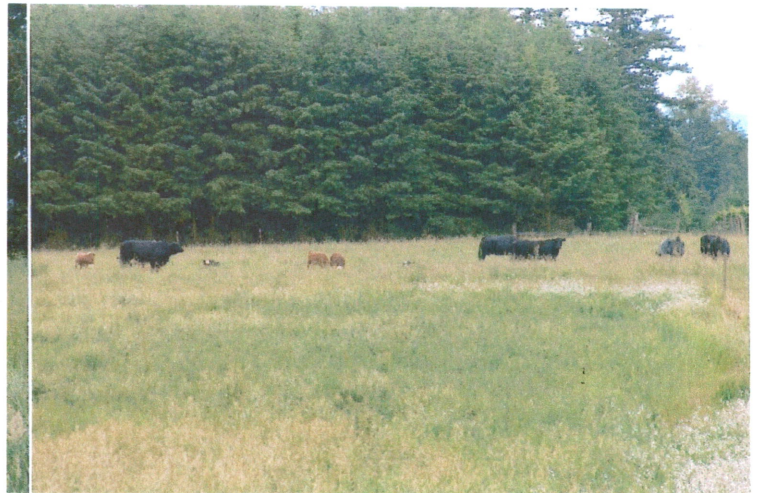
Lloyd Hobart's beef cattle (May 2005)