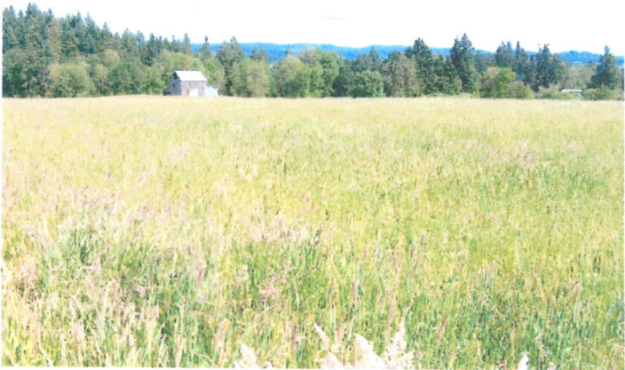
Hay field with barn in background (May 2005)