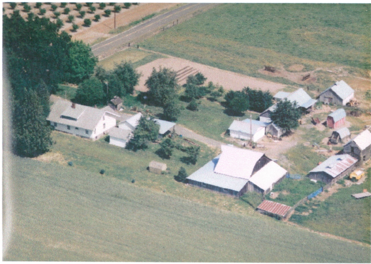
Aerial picture of current house site