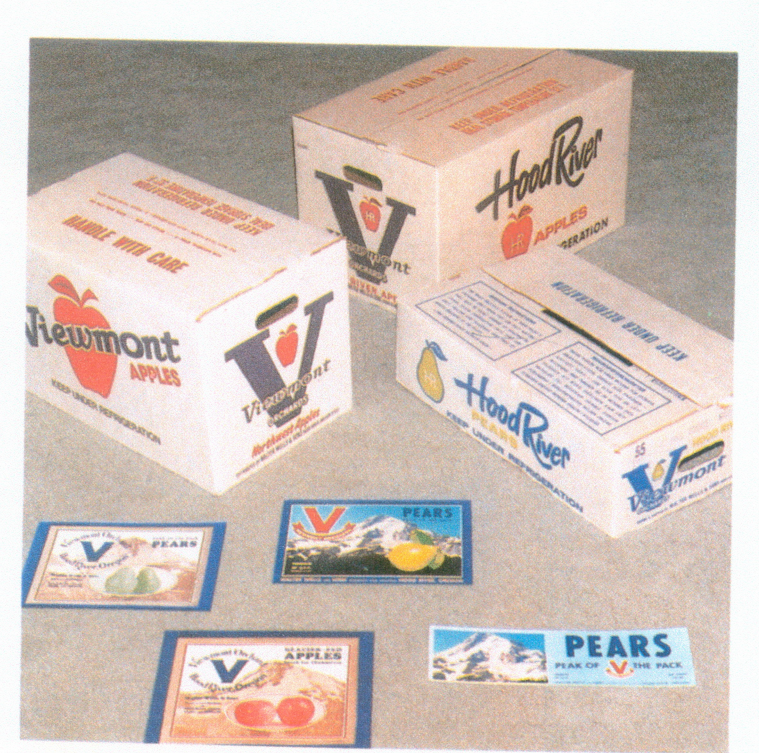
These are labels used on the old wooden apple and pear boxes for years. The labels had to be pasted to the end of each box. With the advent of the cardboard box, of course, the label is printed right on the box lid as it is made. VIEWMONT brand is a label used by Walter Wells and Sons since the mid 1930s.