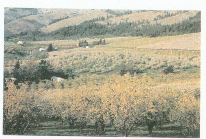
The Wells orchards, shown above, are spread across the hills of the Hood River Valley. In addition to red pears, apples are also grown.