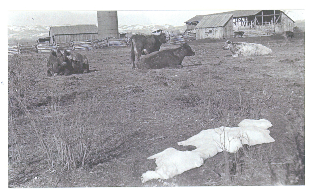
Milk cows in the pasture — the machine shed, silo, barns, corral in background.