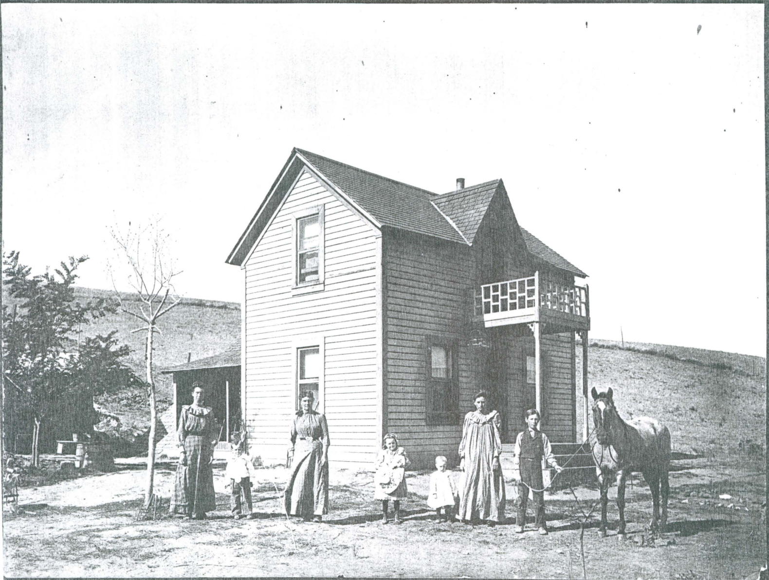
Picture of homestead around 1900.