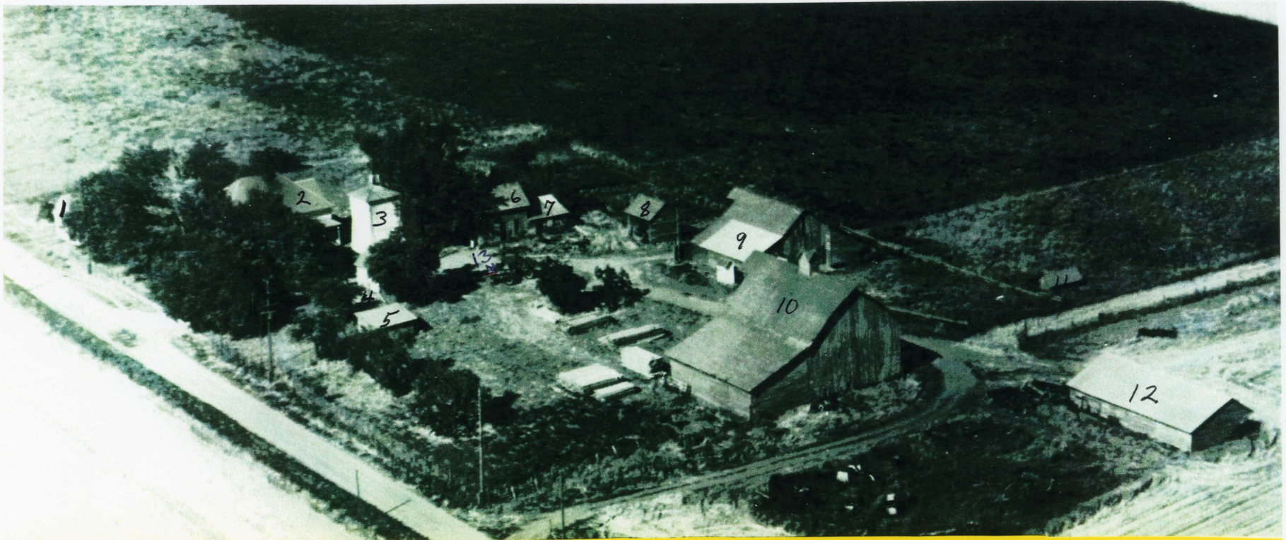
W. J. Case Farm 1940-1941

And present day 2000 (next photo). Part of the lumber had been delivered (below) in preparation for the building of the long white shop (in next photo).