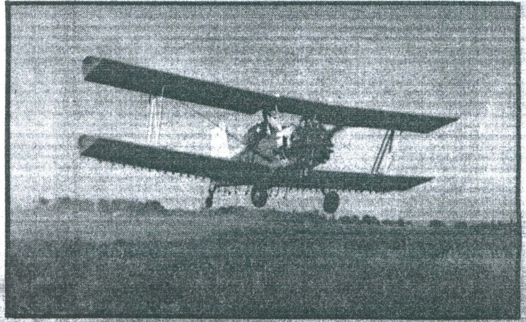
Lanny West does some of his best work at ground level.

Other applicators operate similar firms in the area, helping make Eastern Oregon's landscape a produc-