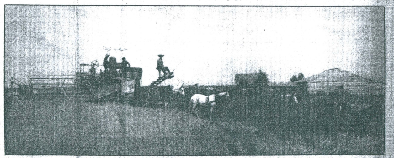
An early threshing scene on the Scott farm.