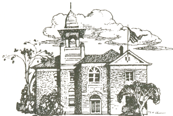
SHERMAN COUNTY, OREGON 1889-1989