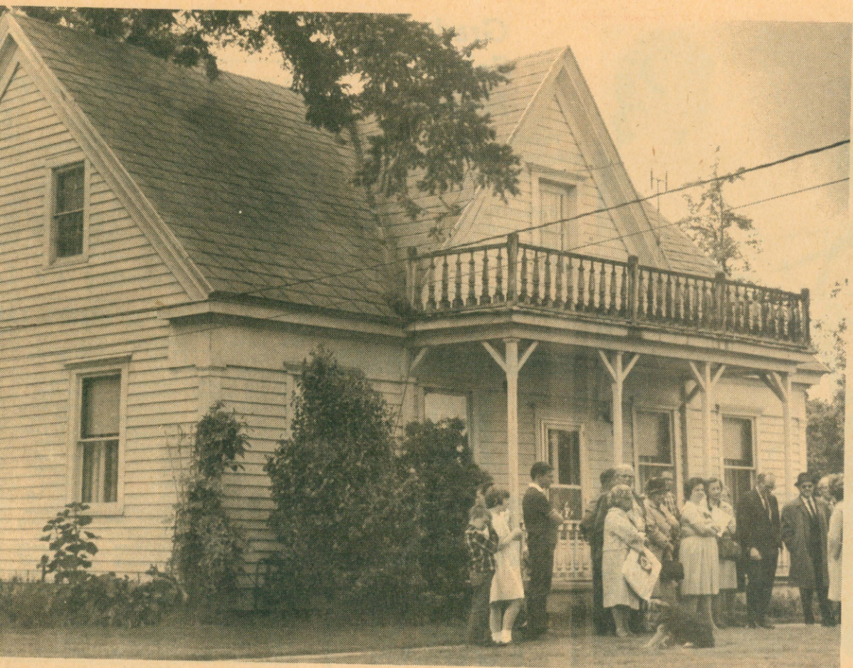
Augustus Fanno, built home in 1850's ithstand storms and house remains in good se was fifth Century home to be marked by