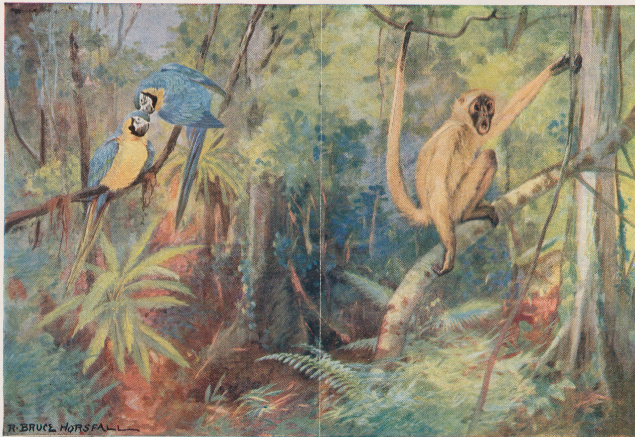
Visit jungles, boiling lakes and deserts with the photographers and naturalists of Nature Magazine.