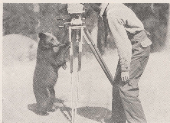
There is something human and appealing about bears. Naturalists and photographers of Nature Magazine meet them under all sorts of circumstances.