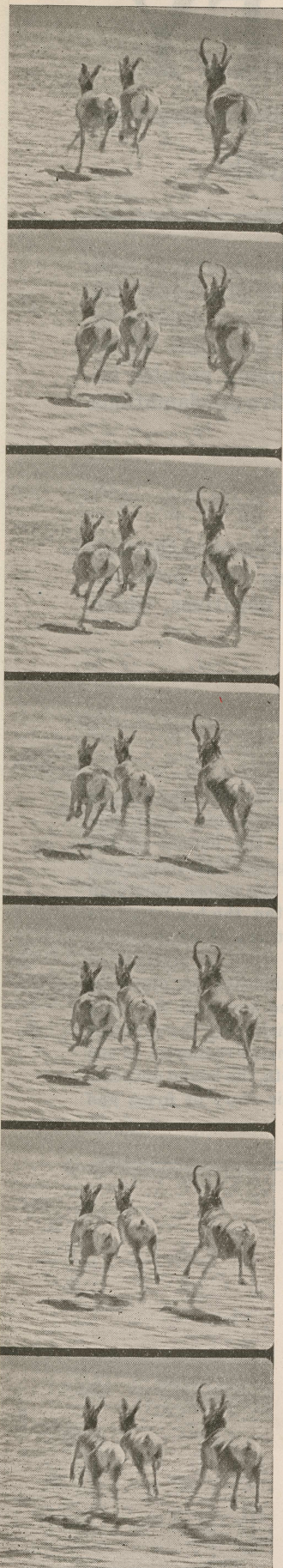
Pronghorns or Antelope