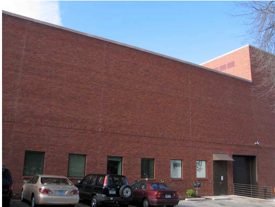
Figure 1. Museum of Art rear elevation/2004 addition